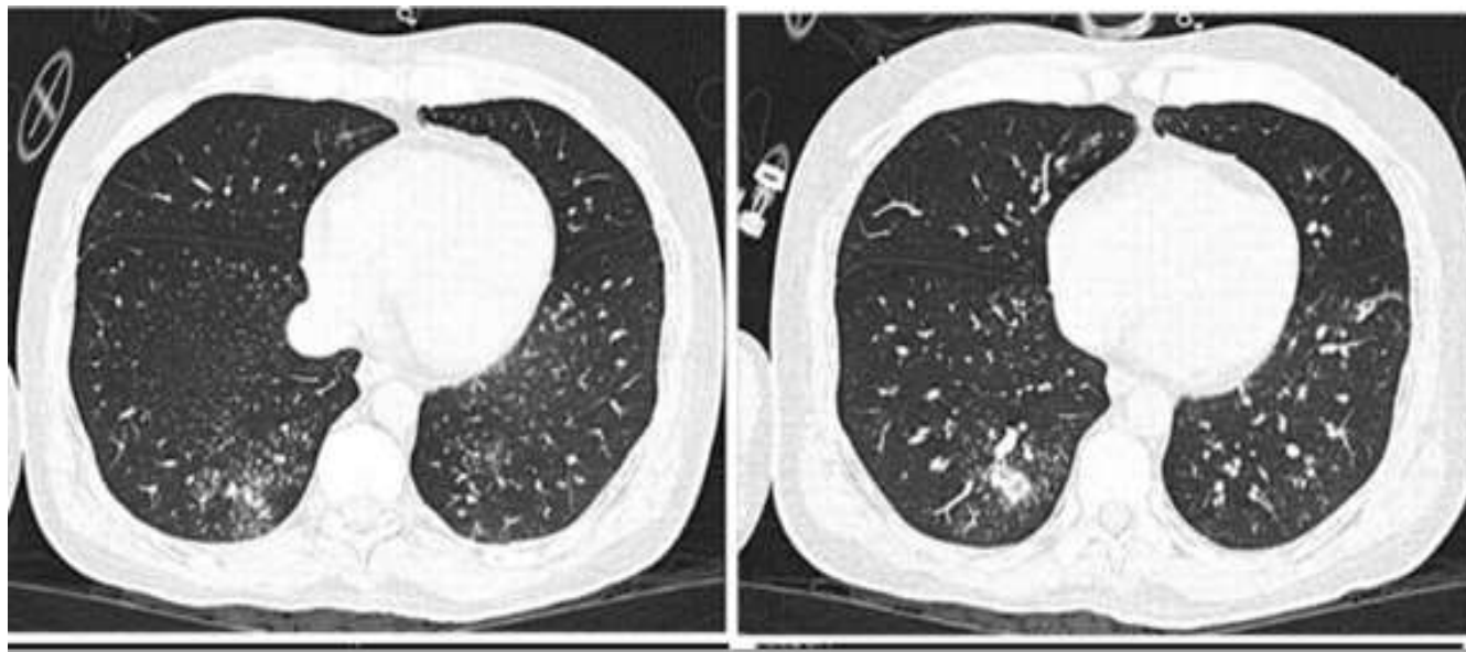
Figure 1: Chest CT scan showing a diffuse micronodular pattern with peripheral distribution in the lower lobes, predominantly on the right side, coexisting with a tree-in-bud pattern.

Diagnosis was made by biopsy, leading to the initiation of antifungal treatment for Candida albicans was started. Clinical symptoms improved, and ventilatory parameters normalized until weaning was achieved.